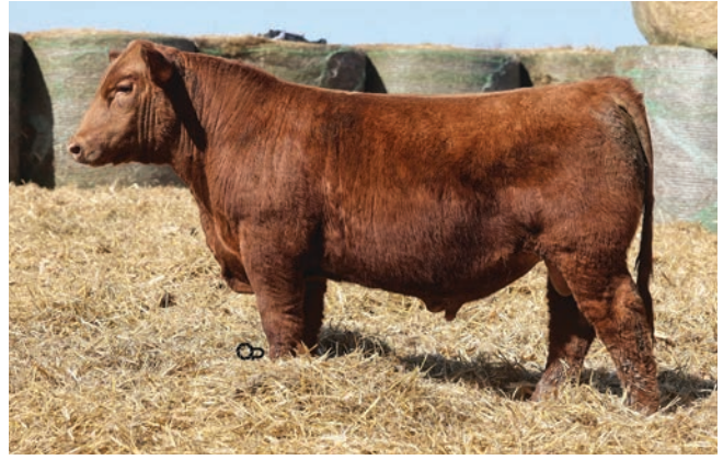
7KZG MR WICK L753