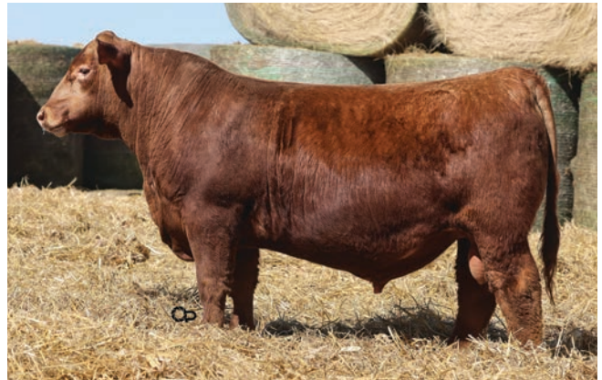
RGG FRANCHISE 37J L317