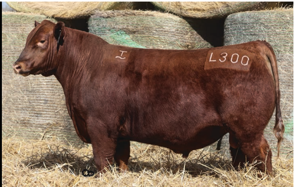
TWG HOLTON FRANCHISE L300