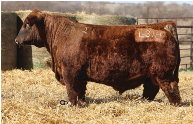
TWG RED EYE L314