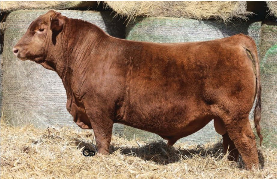
7KZG LAREDO L298