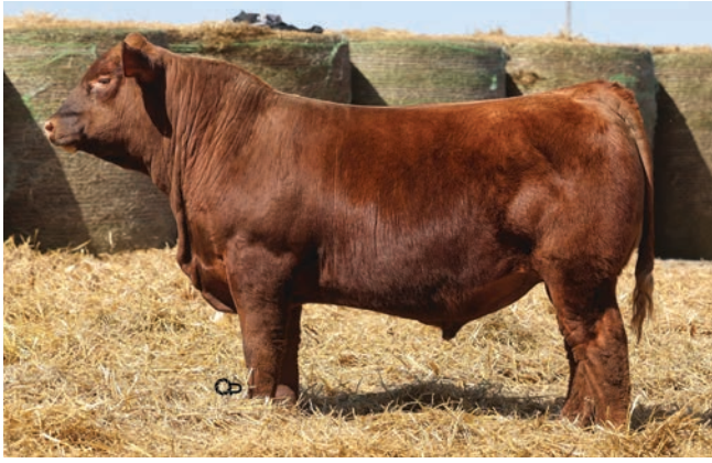
TWG HAWTHORN L326