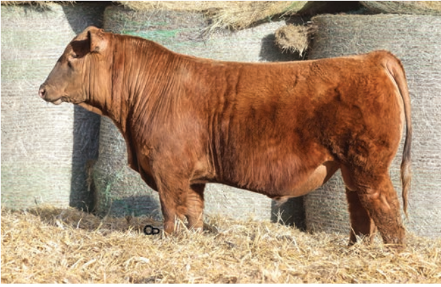
7KZG BRANDO 68K