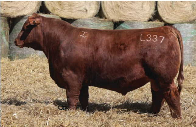
TWG HAWTHORN L337