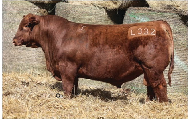
TWG HAWTHORN L332