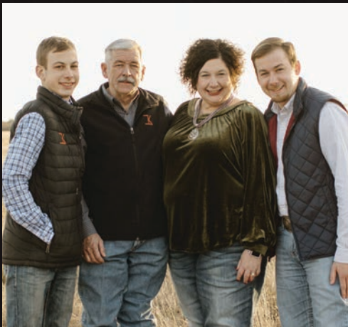
The Kimmey Family